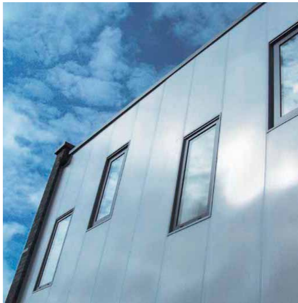
■ Fitting contractor: Architectural Products - London - cladding and porch roof: Danpalon 8 and 10 MC 600 Ice.

The Agar Grove nursery school in London, designed by the Architectural Products firm, was delivered in 2008. The use of 10 mm Danpalon Ice panels gave this kindergarten a marvellous, smooth appearance and a perfect roof. Haverstock Associates, designed the project with the purpose of achieving a glazed appearance, for which Danpalon Ice proved to be the ideal material. The outside walls include 25 identically sized windows in Danpalon panels. The detail and solderless finish of these windows by Architectural Products enhances the building's elegant character. Dan