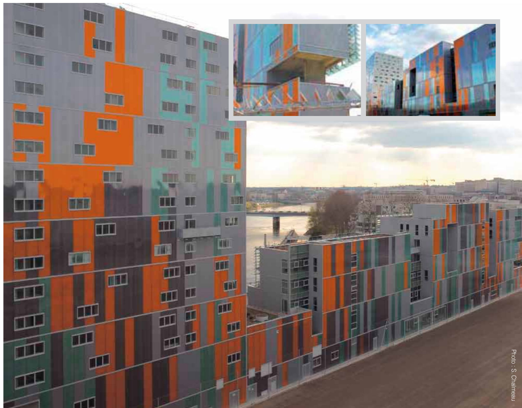
■ Fitting contractor: Cladding: Axima, Nantes (44) - Tel: 02 40 32 49 90 - Sunshades: Ateliers David, Guérande (44) - Tel: 02 40 24 90 34 Northside: 4400m 2 Danpalon 16 cladding, MC 1040 Aluminium, Green, Grey, Orange, Opal, Red - Southside (Sunshade): 2500m 2 Danpalon Blue, Crystal, Grey, Orange, Green.