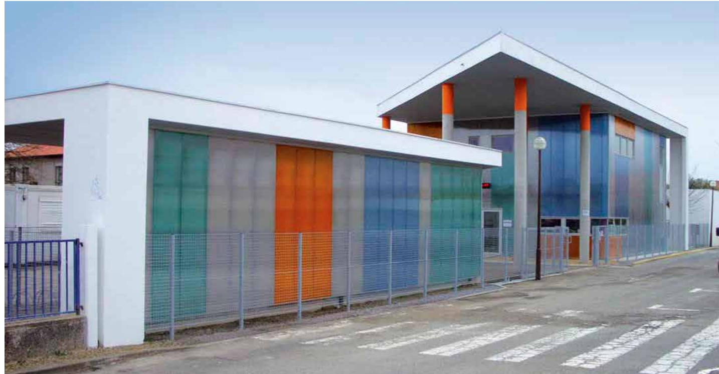
■ Fitting contractor: Miroiterie Lapegue, Dax (40) - Tel: 05 58 74 28 74 - Double Danpalon wall on a vertical aluminium frame: Danpalon 16600 sq. m. Green, Blue, Orange, Crystal.

A school with light, bright walls. In a word, playful!