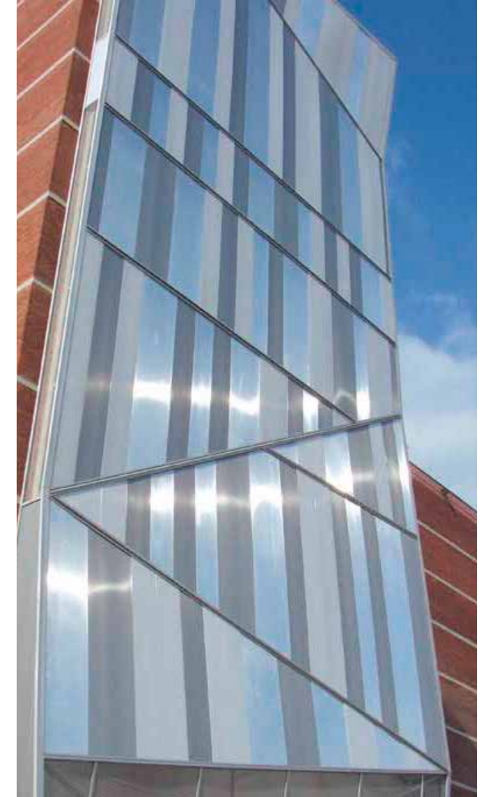
■ Fitting contractor: ATV Design, Houilles (78) - Tel: 06 26 04 44 78. Cladding Danpalon 16 MC 600 and 1040 Crystal, Opal and Aluminium.

for three tones from the same family, which increases the contrasts even further." Designed as an abstract work of art, the façade is made up of countless triangular cutouts alternating with horizontal bands. (Congratulations to ATV Design, the fitting contractor!) These changes of direction and levels make the whole thing vibrate, optimise the glints of light and play with the reflections. "The project comes up to our expectations, it gives this block a strong personality, and the residents are reacting positively. Everyone has appropriated it, often for different reasons, either because they find in it landscape legitimacy or because of its playful, attractive side", concludes the architect.